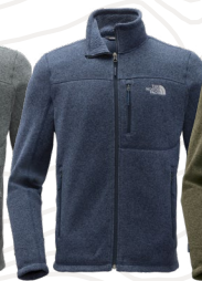
URBAN NAVY HEATHER