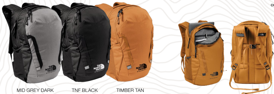
MID GREY DARK HEATHER/TNF BLACK