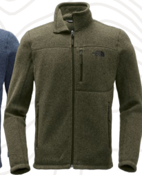
NEW TAUPE GREEN HEATHER