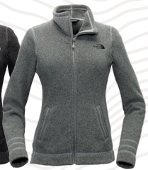
TNF MEDIUM GREY HEATHER