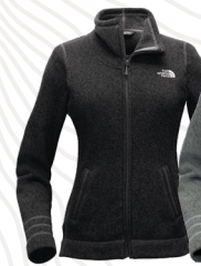
TNF BLACK HEATHER