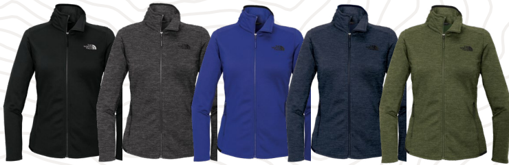
TNF BLACK TNF DARK GREY HEATHER LAPIS BLUE URBAN NAVY HEATHER FOUR LEAF CLOVER HEATHER