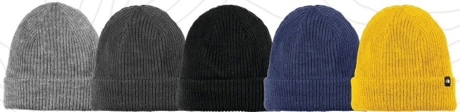
TNF MEDIUM GREY HEATHER