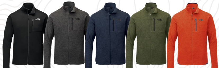
TNF BLACK TNF DARK GREY HEATHER URBAN NAVY HEATHER FOUR LEAF CLOVER HEATHER ZION ORANGE HEATHER

Prices (R) apply to sizes S-XL and are subject to change. Please inquire for pricing on larger sizes.