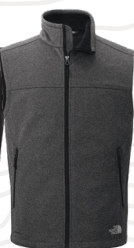
TNF DARK GREY HEATHER