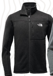
TNF BLACK HEATHER