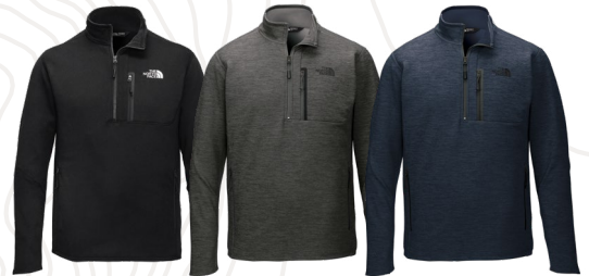
TNF BLACK TNF DARK GREY HEATHER URBAN NAVY HEATHER