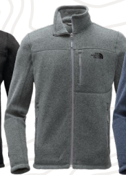
TNF MEDIUM GREY HEATHER