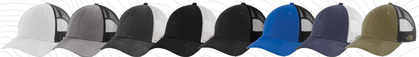
VINTAGE WHITE/ ASPHALT GREY